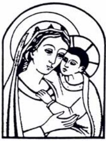
Our Lady of Good Counsel