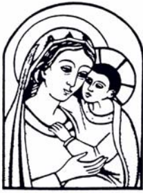
Our Lady of Good Counsel

The Ladies of CCW cordially invite you to attend their Welcome Dinner and meeting.