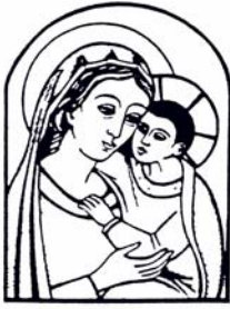
Our Lady of Good Counsel

The Ladies of CCW cordially invite you to attend their Welcome Dinner and meeting.