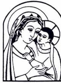
Our Lady of Good Counsel

The Ladies of CCW cordially invite you to attend their Welcome Dinner and meeting.