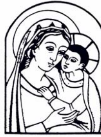
Our Lady of Good Counsel

The Ladies of CCW cordially invite you to attend their Welcome Dinner and meeting.