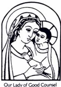
Our Lady of Good Counsel