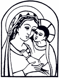
Our Lady of Good Counsel